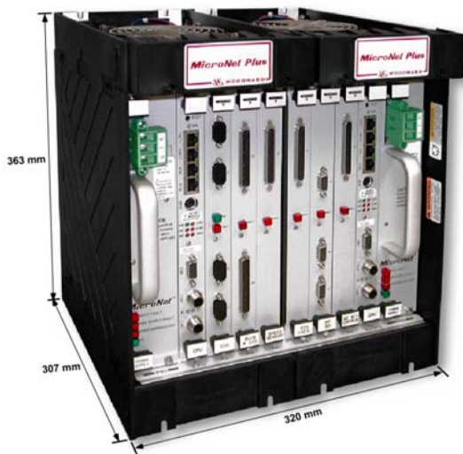
MicroNet Plus Control Chassis (8 VME slot option)

Power supplies may be simplex or redundant in any combination of input voltages.