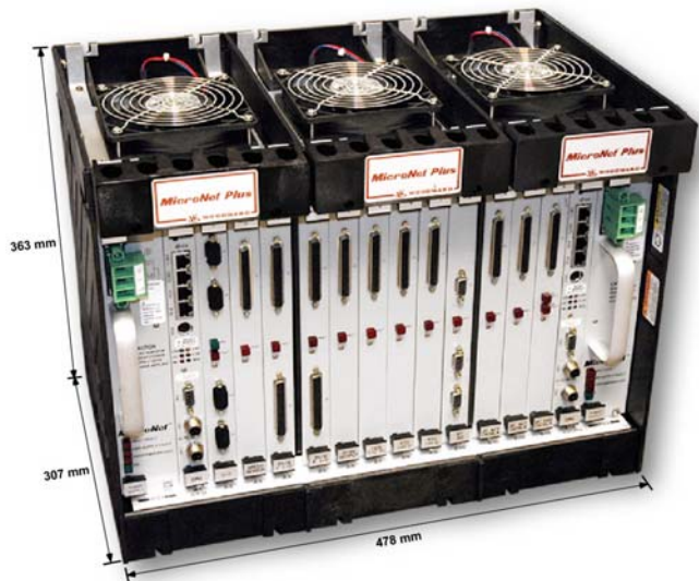
MicroNet Plus Control Chassis (14 VME slot option)