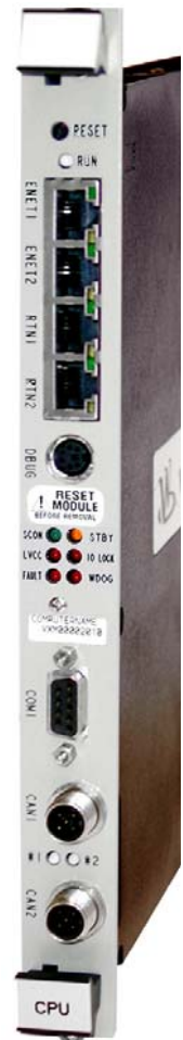
MicroNet Plus CPU5200

The MicroNet Plus system is capable of running in a redundant master / standby configuration to provide higher availability. Synchronized memory assures that both CPUs use the same operating information in every rate group. If the master CPU becomes inoperable, full system control, including control of the I/O, is transferred to the standby CPU in less than 1 ms without affecting prime mover operation. After correcting the master CPU fault, the system can continue running on the standby CPU, or control of the system can be transferred back to the original master CPU. Annunciation of any control transfer is given through communication links.